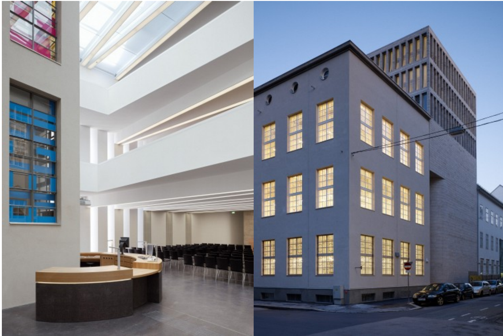
EDUG DDC Symposium 2011, Stockholm, April 7, 2011