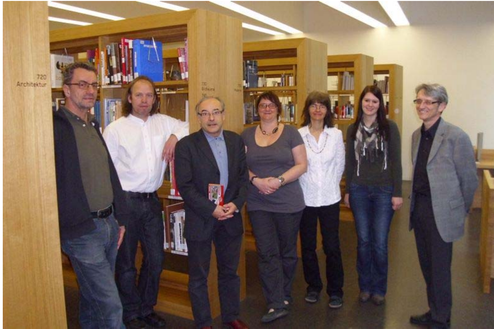
EDUG DDC Symposium 2011, Stockholm, April 7, 2011